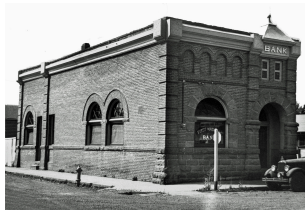
First State Bank of Elgin